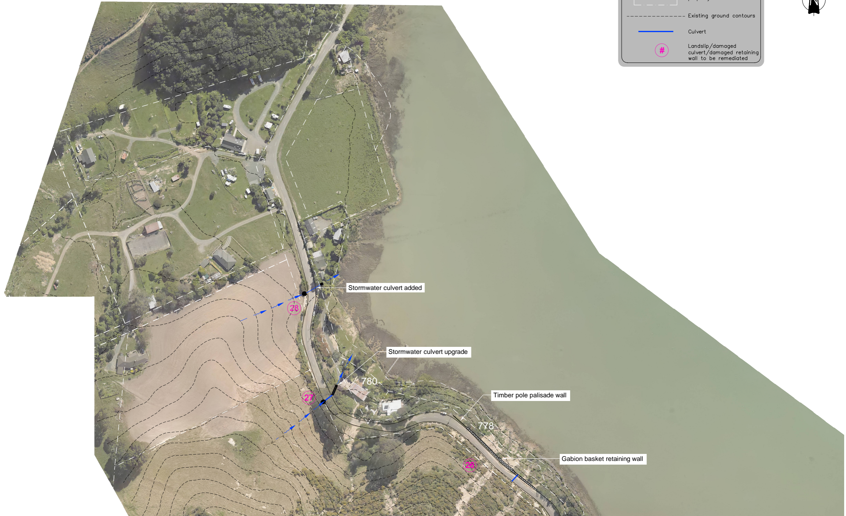
Aerial photo and cadastral boundaries supplied Nelson City Council