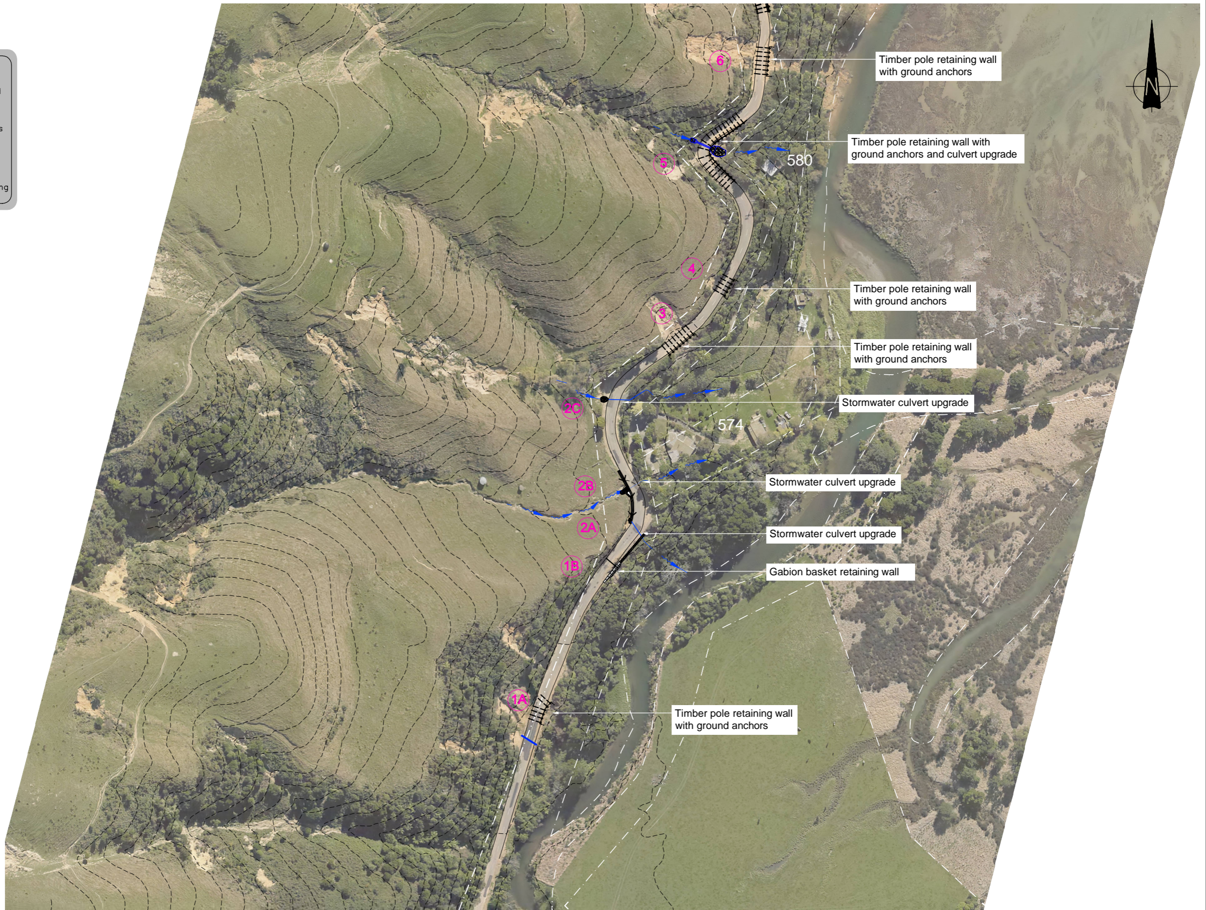
Aerial photo and cadastral boundaries