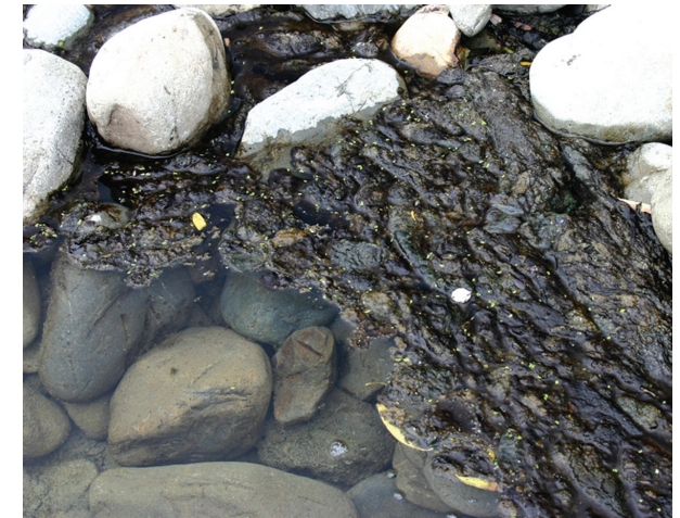
Blue-green algal mats forming a floating 'raft' on the water's surface

If you see thick blue-green algal mats, please contact the Council on 546 0200.