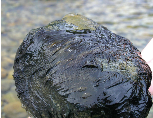
Toxic Blue-green algae

Blue-green algal mats are actually dark brown or black and grow attached to rocks on the river bed. Mats that come loose from the river bed can wash up on the river bank or form floating 'rafts' in shallow areas. Where exposed, the mats may dry out and turn a light brown or white colour. They may also produce a strong musty odour.