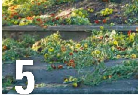
5 Vandals wreak havoc on the Hill.