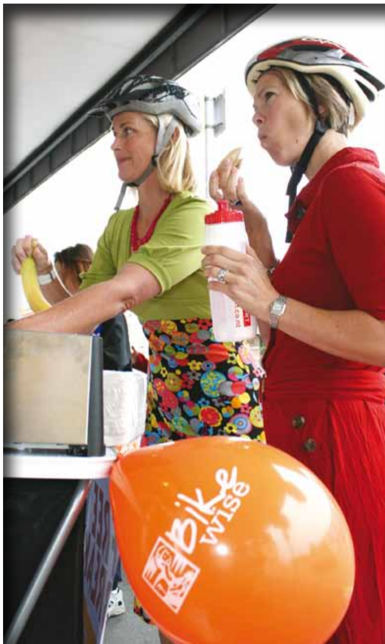
Enjoy a free breakfast with Go By Bike Day.