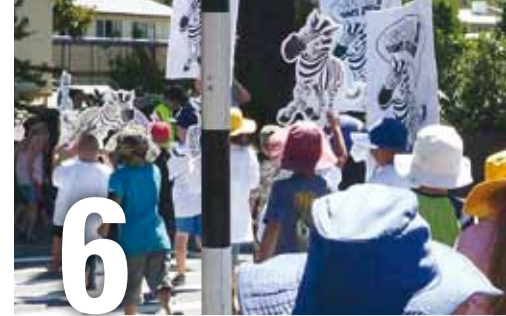
6 Look out - zebra crossing!