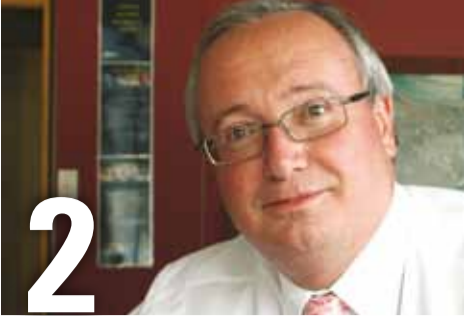
2 Council CEO resigns.

www.facebook.com/nelsoncitycouncil Find us on Facebook