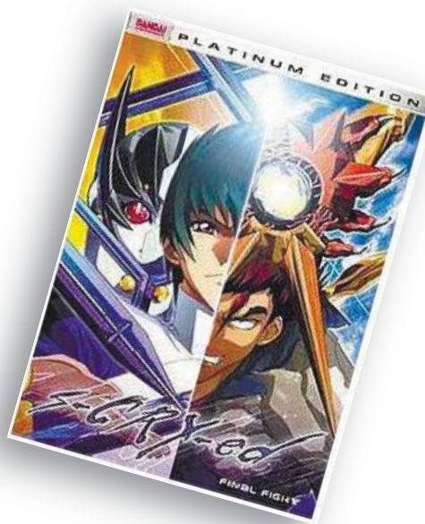
Anime Movie Night