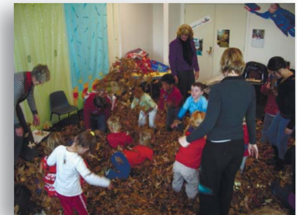
Storytime at Elma Turner Library

For information about these programmes and when they are run see our website or ask at one of our libraries.