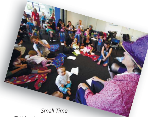
Small Time Children's programme