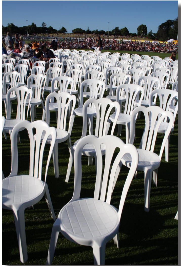
Potential flow of visitors past Nelson from RWC 2011

One point to note is that fans are likely to be committed to pre-arranged activities on weekends when there are big matches. It looks like the best chance to snare visitors is during weekdays.